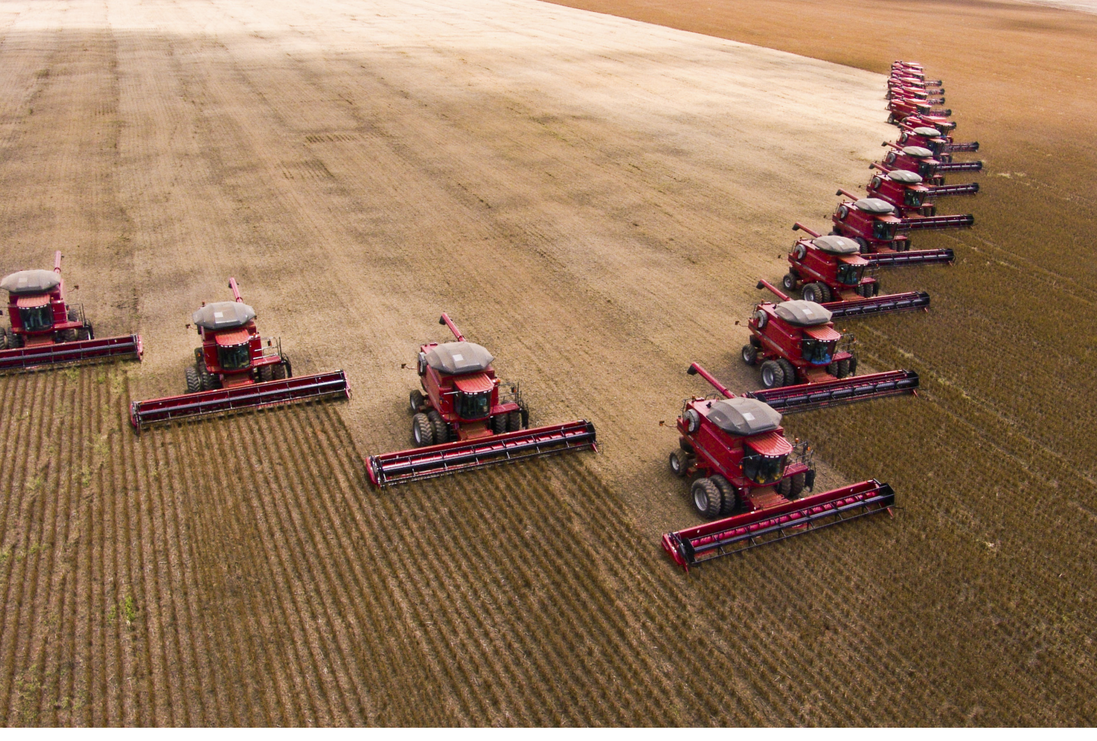
Combine harvesters in soy field in Campo Verde, Mato Grosso, Brasil