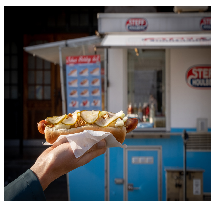
Danish hot dog

Danish Crown has taken steps since our initial contact in June 2019 and has committed to join the "Danish Alliance for Responsible Soy" in September 2019.25,26 The Alliance acknowledges the need for concrete measures to ensure responsible protein imports to Denmark and lays out a vision for responsible and deforestation-free soy imports. However, the lack of clear and concrete measures and time-bound goals makes the initiative fall short. The schedule for implementation of its measures is up to each member, and the initiative includes no mechanisms to