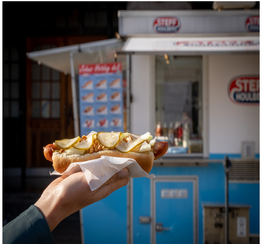
Danish hot dog

Danish Crown has taken steps since our initial contact in June 2019 and has committed to join the “Danish Alliance for Responsible Soy” in September 2019. 25, 26 The Alliance acknowledges the need for concrete measures to ensure responsible protein imports to Denmark and lays out a vision for responsible and deforestation-free soy imports. However, the lack of clear and concrete measures and time-bound goals makes the initiative fall short. The schedule for implementation of its measures is up to each member, and the initiative includes no mechanisms to hold the members accountable for their commitments.