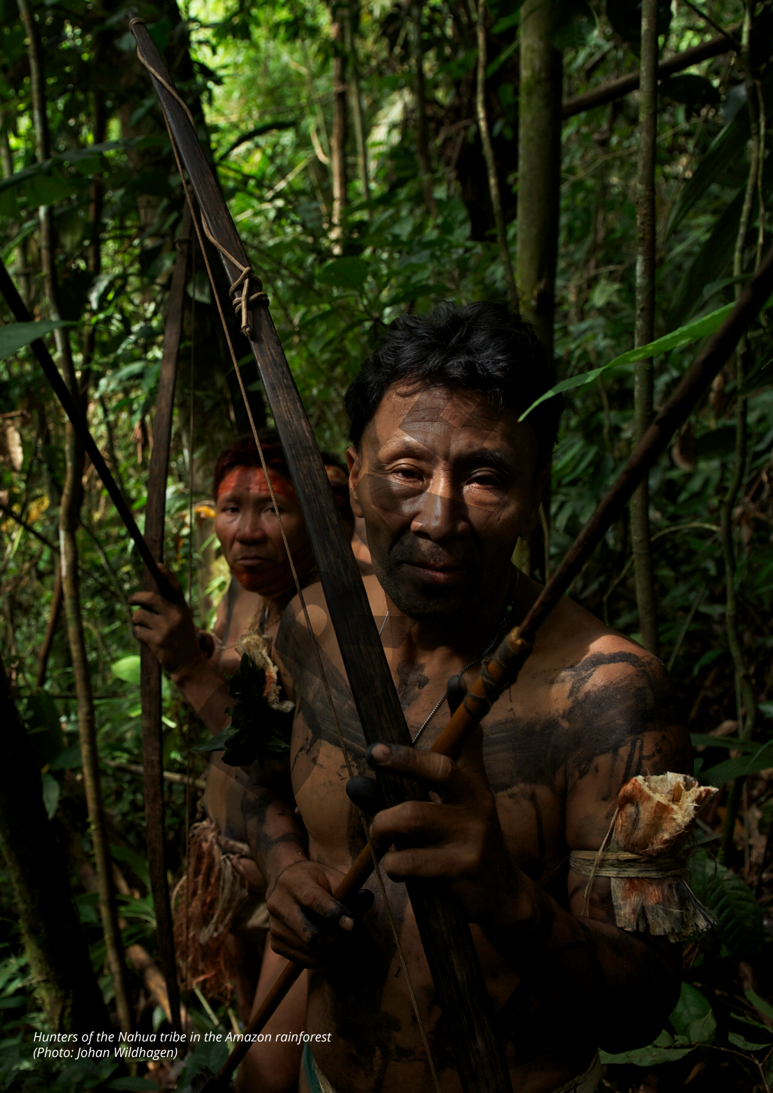
Hunters of the Nahua tribe in the Amazon rainforest