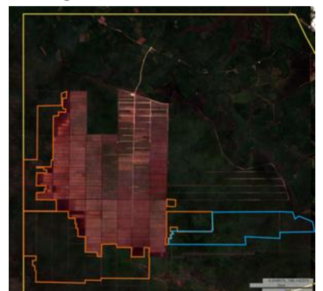
Date: May 6, 2020